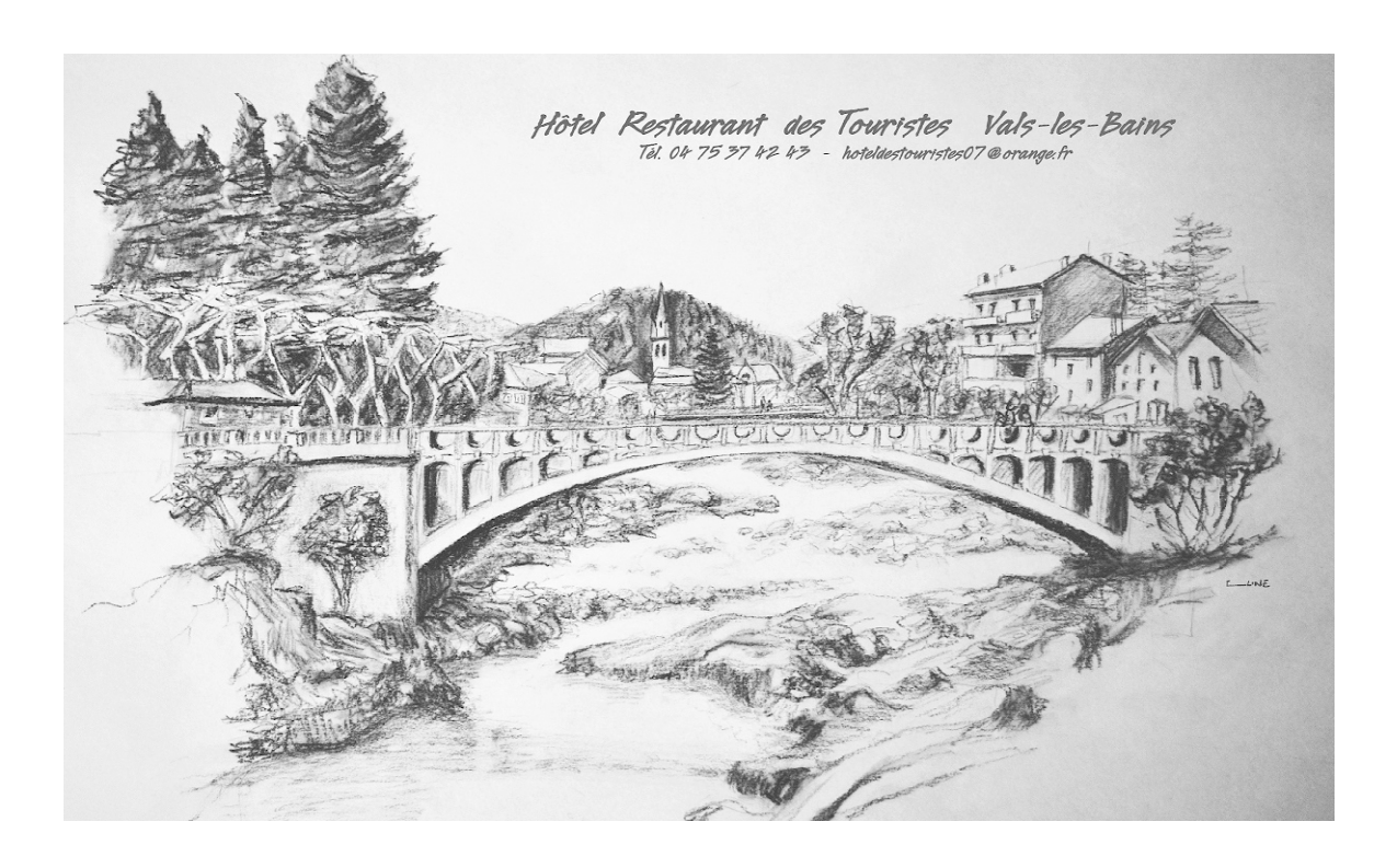
Have a good stay

13, rue Auguste Clément, 07600 Vals les Bains Tel. 0033 04.75.37.42.43